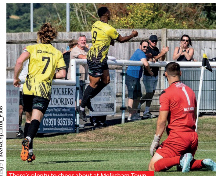
There's plenty to cheer about at Melksham Town

Last season finished with an eighth-place berth and hopes are high that this can be built upon this time around, whilst for Monday's hosts, Larkhall Athletic, they sailed a little too close to the wind last season as they narrowly avoided the drop and they are determined to avoid a repeat of that this time around.